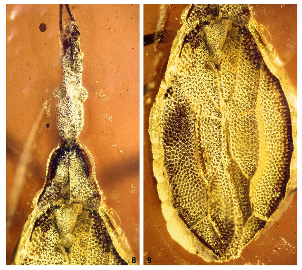
Figs. 8–9: Tingiometra burmanica sp.n. (holotype): (8) head, pronotum and scutellum; (9) hemelytral structure, dorsal view.

Etymology: The epithet refers to the country of origin of the amber inclusions.