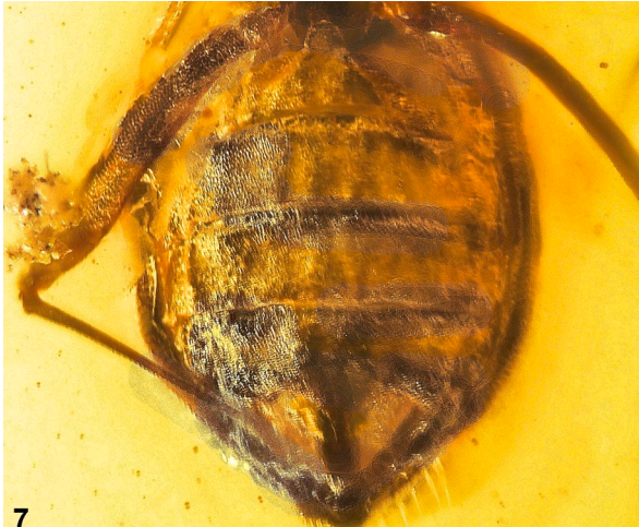
Figs. 4–7: Tingiometra burmanica sp.n. (holotype): (4) dorsal view; (5) lateral view; (6) ventral view; (7) terminal ventral segments.

plate of segment VII (DRAKE & DAVIS 1960). Details of ventral apex are not discernible in the holotype.