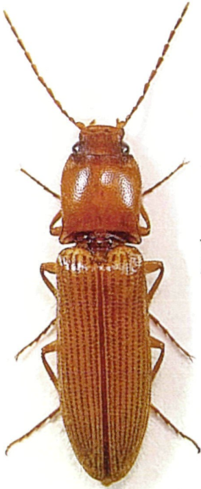
Fig. 1. Elathous ekaterinae n. sp.