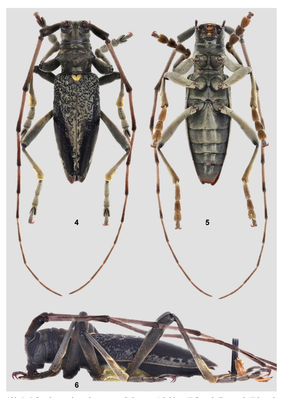
Abb.\,4-6.\,\textit{Parahepomidion odaensis}\,sp.n.\,(holotype,\,\circlearrowleft), habitus.\,(4)\,Dorsal; (5)\,ventral; (6)\,lateral.