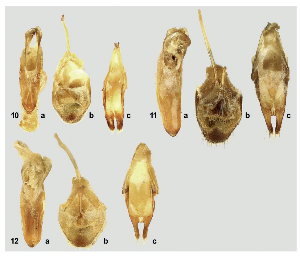
Abb. 10–12. Genitalia of males of (10) P. bongaensis sp.n.; (11) P. odaensis sp.n.; (12) P. hiermeieri . (a) Median lobe; (b) tergite VIII; (c) tegmen.