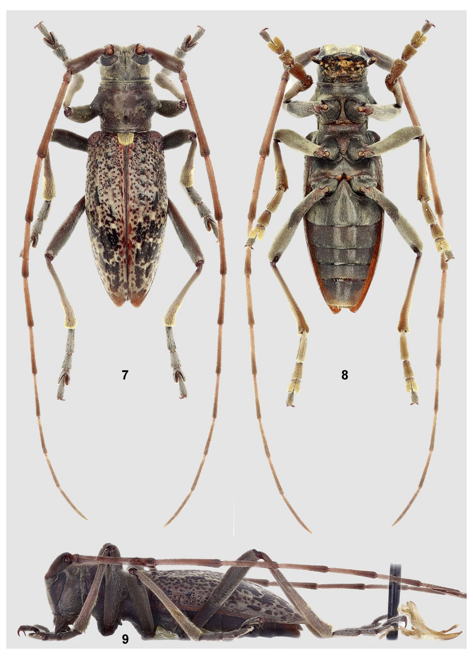
Abb. 7–9. Parahepomidion hiermeieri ( \sigma ), habitus. (7) Dorsal; (8) ventral; (9) lateral.