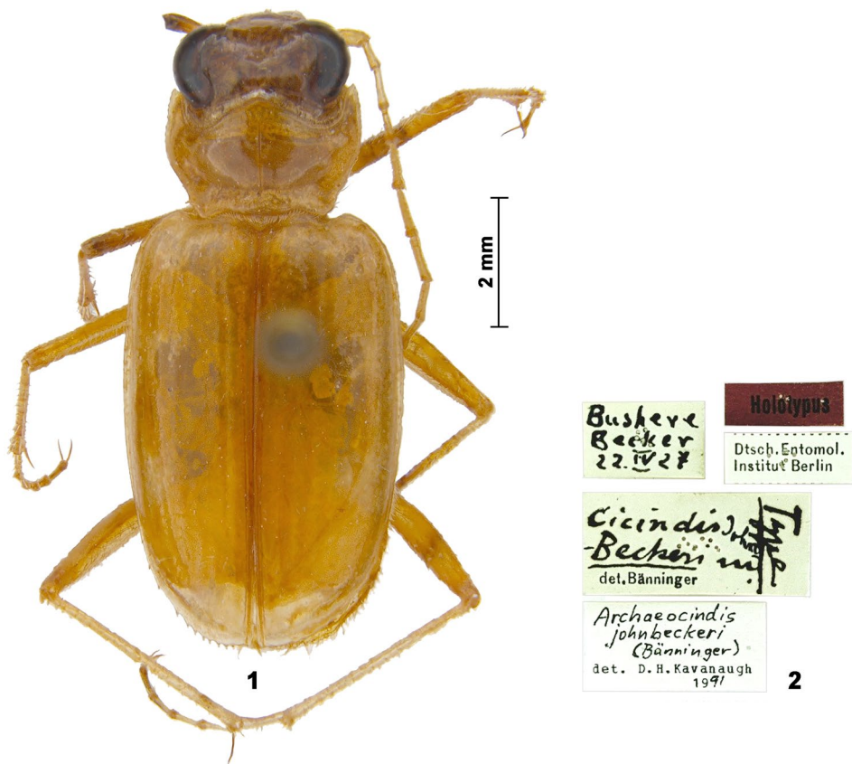
Figs. 1–2: Holotype of Archaeocindis johnbeckeri : (1) dorsal habitus; (2) label.

From 2012 to 2016, the author made several attempts in Bushehr Province to re-collect Archaeocindis johnbeckeri , but was never successful. It is assumed that this species became extinct in this region, chiefly because its characteristic habitats, the salty-grounded sea shores, were destroyed by conversion of the shoreland into cities and ports.