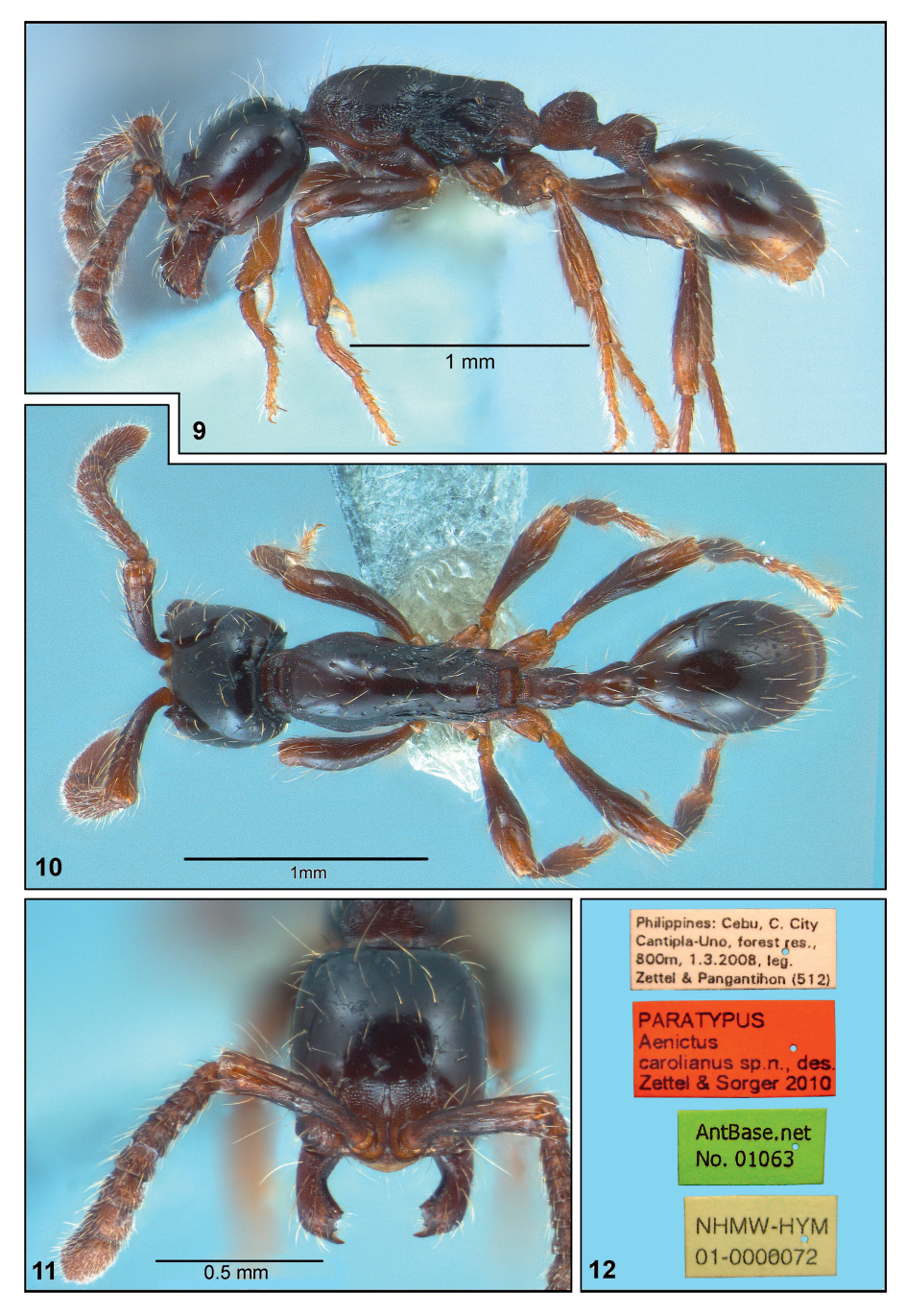
Figs. 9 - 12: Aenictus carolianus sp.n., paratype worker (NHMW; head width 0.59 mm, mesosoma length 0.97 mm). (9) Habitus, lateral aspect. (10) Habitus, dorsal aspect. (11) Head, full face view. (12) Labels.