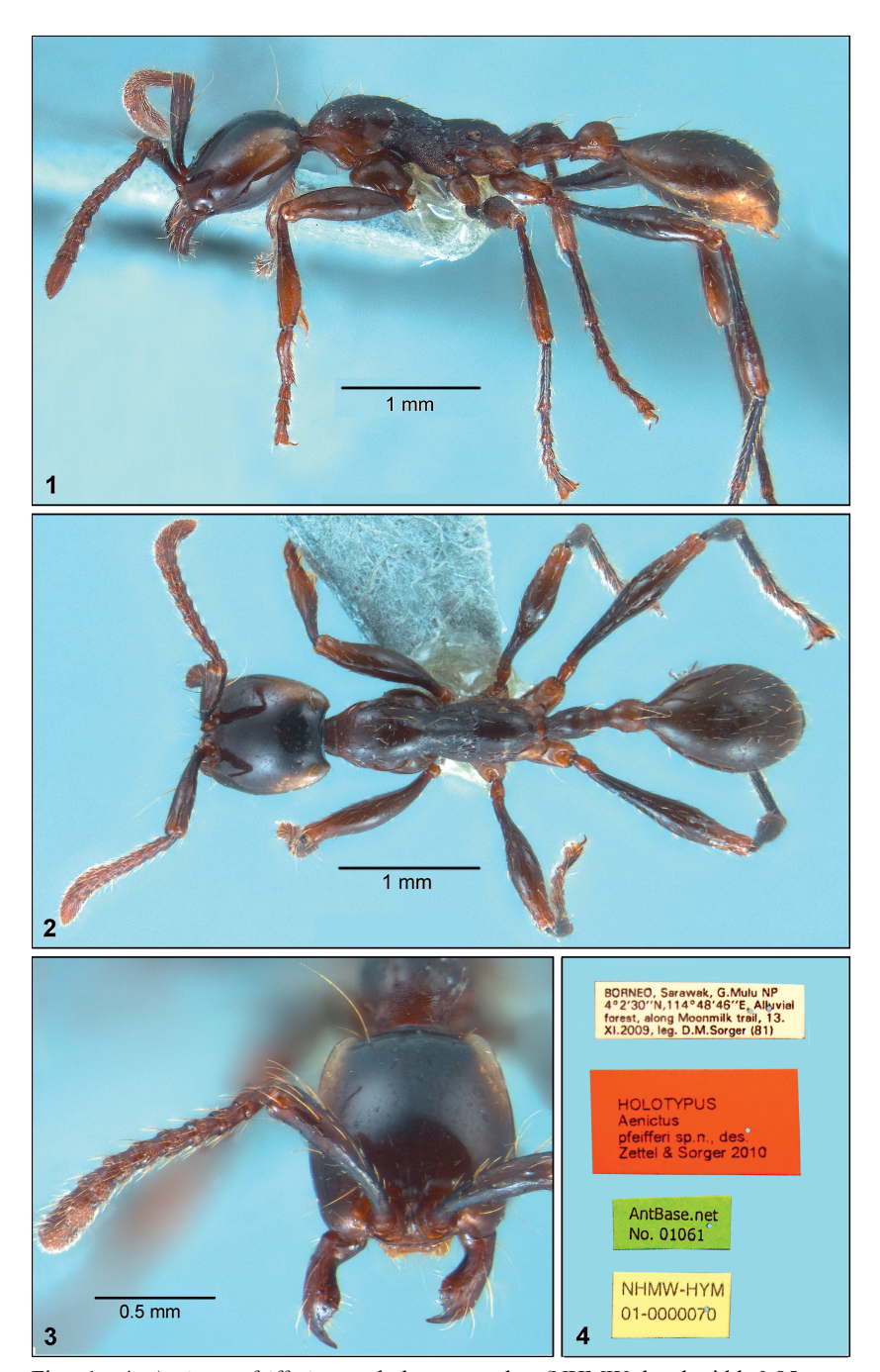
Figs. 1 - 4: Aenictus pfeifferi sp.n., holotype worker (NHMW; head width 0.85 mm, mesosoma length 1.52 mm). (1) Habitus, lateral aspect. (2) Habitus, dorsal aspect. (3) Head, full face view. (4) Labels.