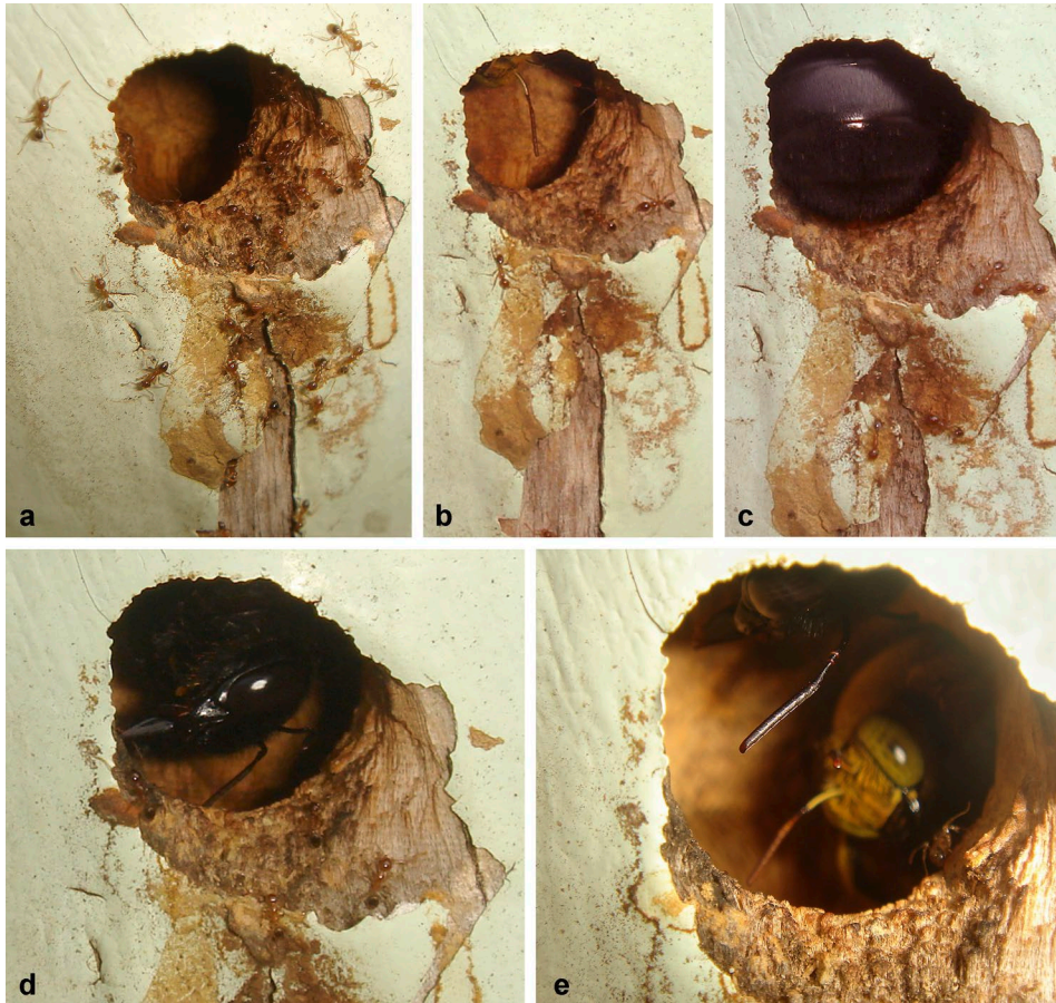
Fig. 3: (a) Several workers of Pheidole megacephala entering the nest of Xylocopa caffra . (b) A Xylocopa male defending the nest entrance with the antennae. (c) A Xylocopa female blocking the entrance hole with the dorsal surface of the abdomen. (d) A Xylocopa female defending the nest with proboscis and antennae. (e) A Xylocopa female (left) and male (right) guarding the nest entrance after the raid.

Although I have often observed a single worker near the entrance holes of Xylocopa nests, I could not find a nest of Tapinoma melanocephala in the study area. The presence of single foraging workers seems to have no negative effects to Xylocopa caffra .