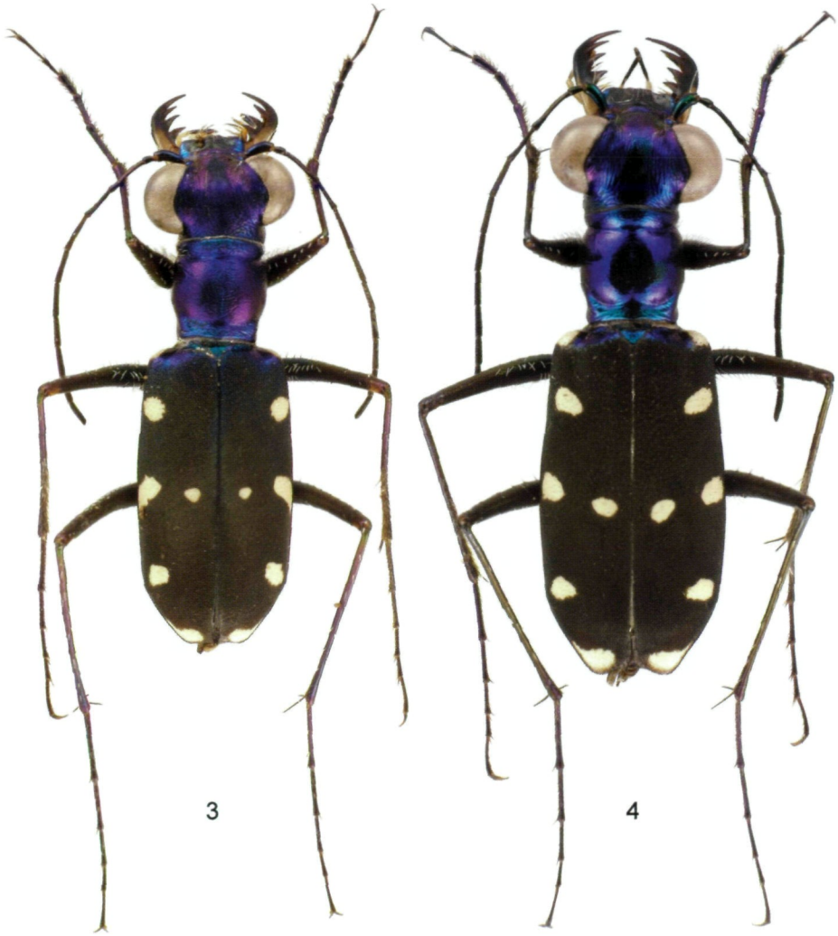
Figs. 3-4: (3) Thopetutica zetteli , habitus of male paratype from Catanduanes Island; (4) T. interposita , habitus of male specimen from Polillo Island.

Underside: Sternal pieces black; mesepimeron, metasternum, posterior part of mesepisternum, and sternum covered with white decumbent hairs. Abdominal sternites black, with some bluish reflections, last three externally visible ones covered with fine decumbent pubescence. Trochanters rufescent; femora metallic dark bronze with violet reflections above and green reflections below, with some rows (especially evident on the front legs) of white, curved hairs; "knees" narrowly metallic dark brown, tibiae and tarsi more or less tinged with metallic dark violet, with a few rows of short, spiniform setae; fore and middle tibiae additionally with numerous short white hairs on apical half.