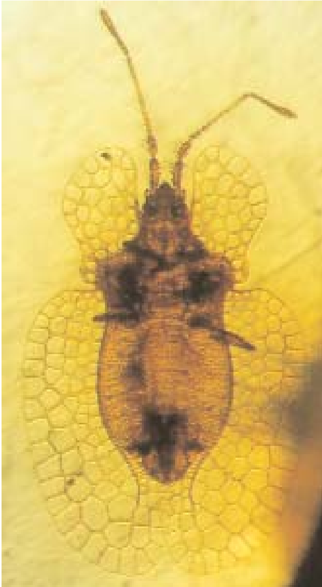
Photo 1. Amberobyrsa brandti gen.n., sp.n., dorsal view of the inclusion.