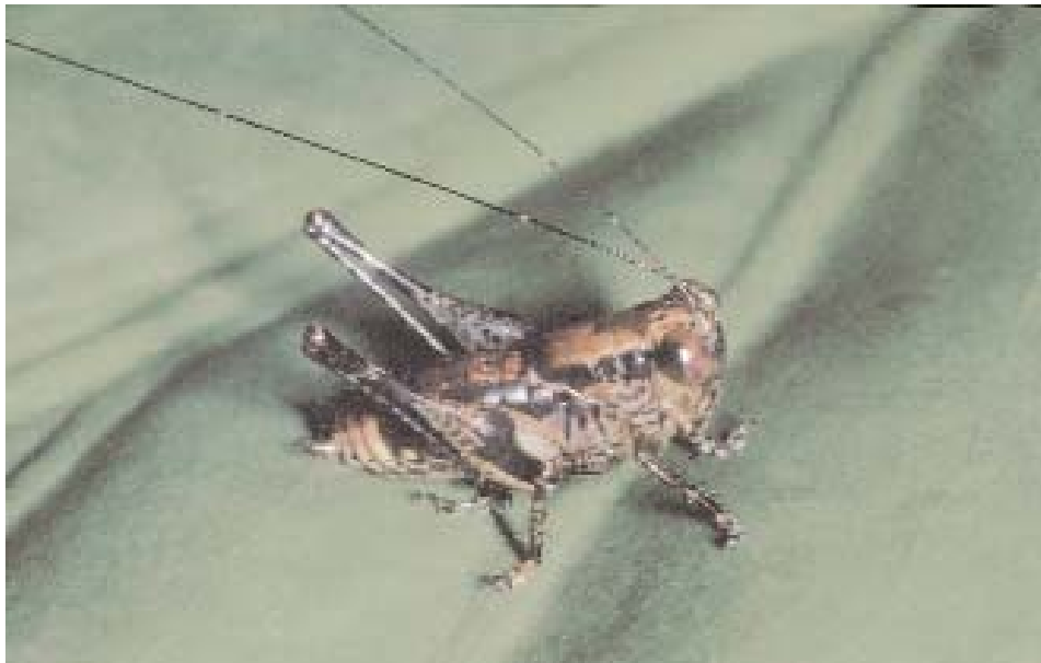
Fig. 1. Lipotactes khmericus (GOROCHOV 1998) ♂