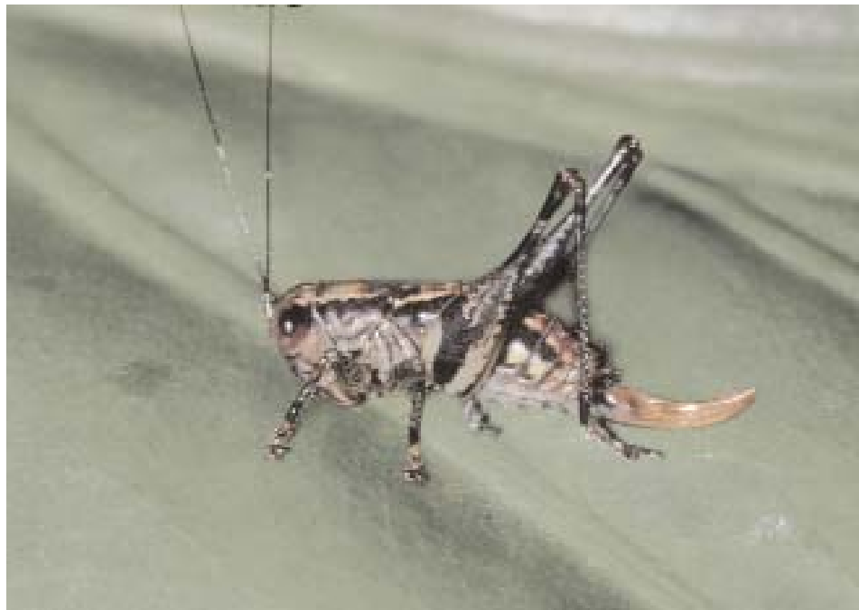
Fig. 2. Lipotactes khmericus (GOROCHOV 1998) ♀